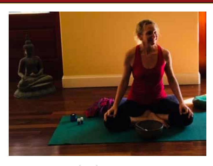
DAY 8: Sat 21 Sep - Shanghai

After breakfast, you will visit Shanghai Museum. After lunch, free time. Overnight: Shanghai B,L