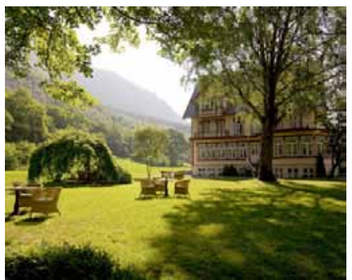
Hotel Union Øye