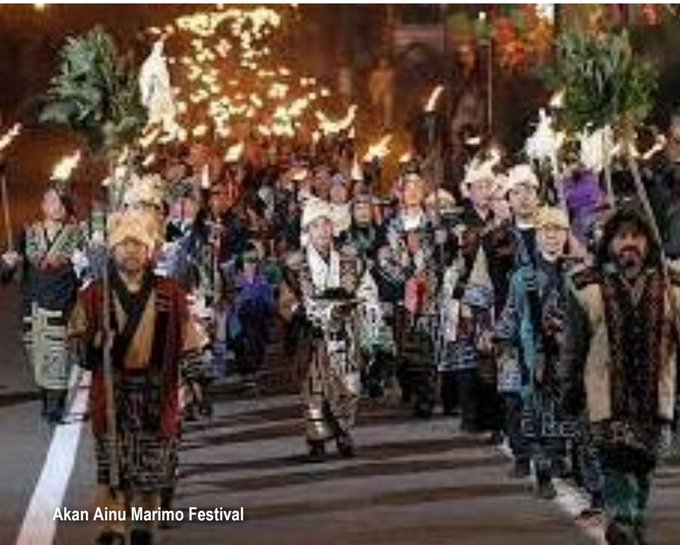
Akan Aino Marimo Festival