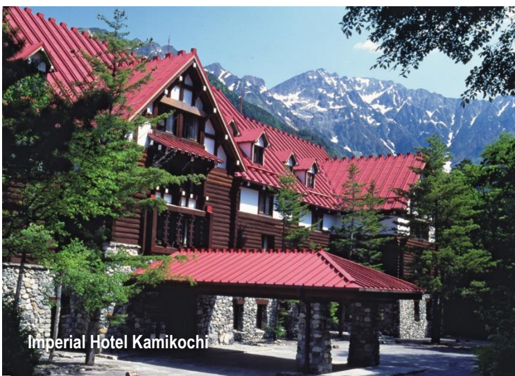
Imperial Hotel Kamikochi

Accommodation: 2 nights at The Imperial Hotel Tokyo