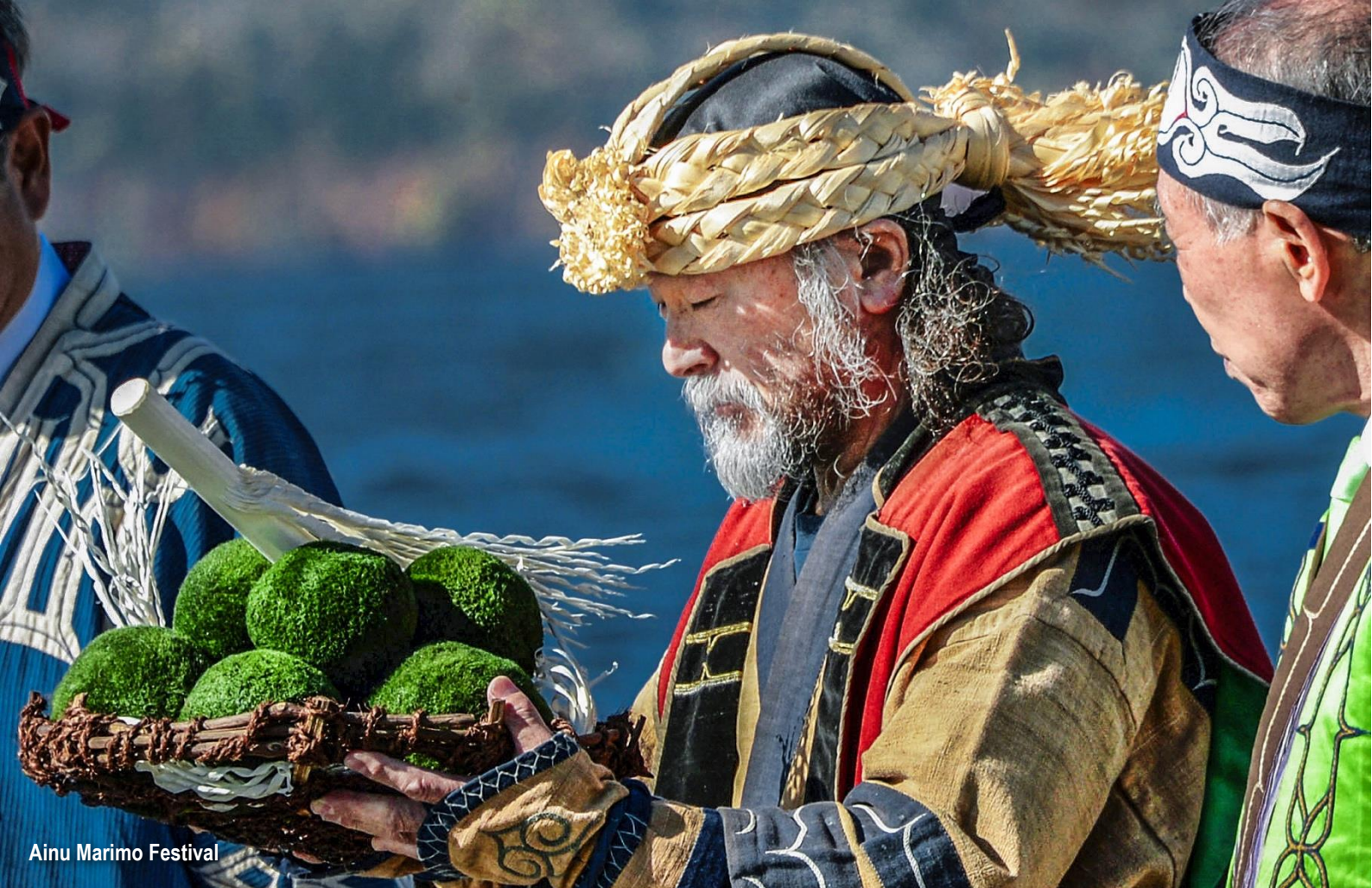
Ainu Marimo Festival