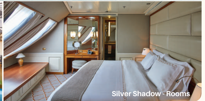
Silver Shadow - Rooms