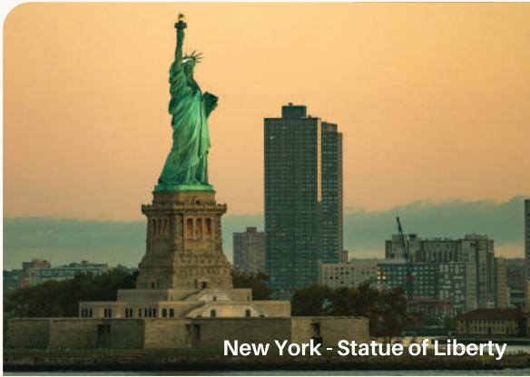
New York - Statue of Liberty