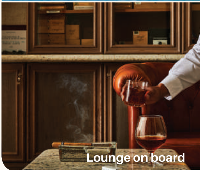
Lounge on board